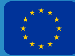
Erasmus Open Spaces

Science students are required to match modules to what they would normally study at UCD when on exchange. Modules at partner universities are not guaranteed.